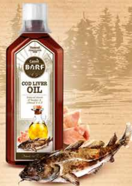
Canvit BARF COD LIVER OIL

Cold-pressed cod liver oil is a rich source of omega-3 fatty acids (DHA, EPA) and vitamins A and D with anti-inflammatory effects. Canvit Cod Liver Oil has beneficial effects on skin health and supports development and growth of bones and teeth in puppies and pregnant and lactating females.