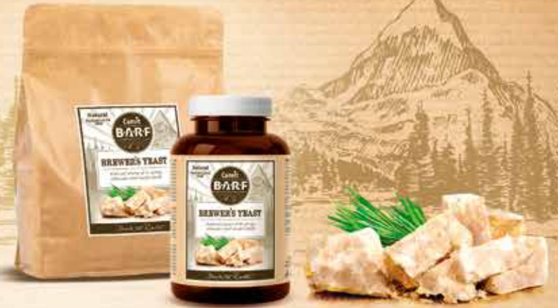
Canvit BARF BREWER'S YEAST

Dose for 10 kg dog: 5-10 g = 1-2 teaspoon daily