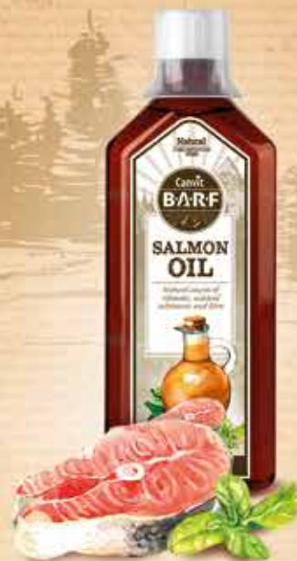
Canvit BARF SALMON OIL

Cold-pressed Norwegian salmon oil is a rich source of omega-3 fatty acids (DHA, EPA) with an anti-inflammatory effect. Salmon oil supports skin health and coat quality and suppresses inflammation during osteoarthritis.