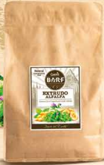
Canvit BARF EXTRUDO ALFAALFA

Complete supplemental kibbles for dogs fed on BARF diets. Canvit BARF Extrudo Alfaalfa is a full source of fibre, amino acids, omega 3 & 6, vitamins, and minerals from alfalfa, dried apples, yellow peas, brewer's yeast, coconut oil, dried dandelions, dried nettles, linseed oil, milk thistle, and yucca. It is an ideal BARF supplement for busy times and travel.