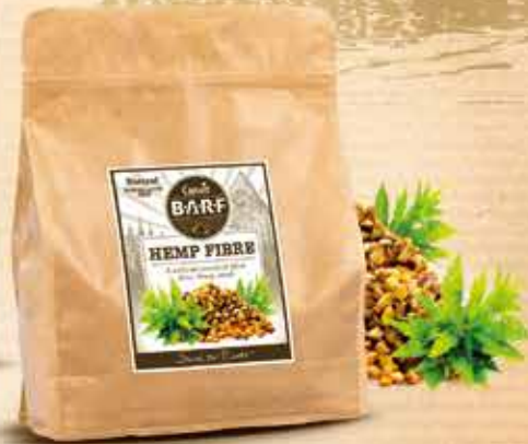
Canvit BARF HEMP FIBRE

A natural source of fibre from hemp seeds. Hemp fibre is rich in easily digestible proteins, omega-3 and omega-6 essential fatty acids, vitamins A, D, and E, and cannabidiols. A source of fibre for dogs with dermatological disorders or dogs who refuse raw food.